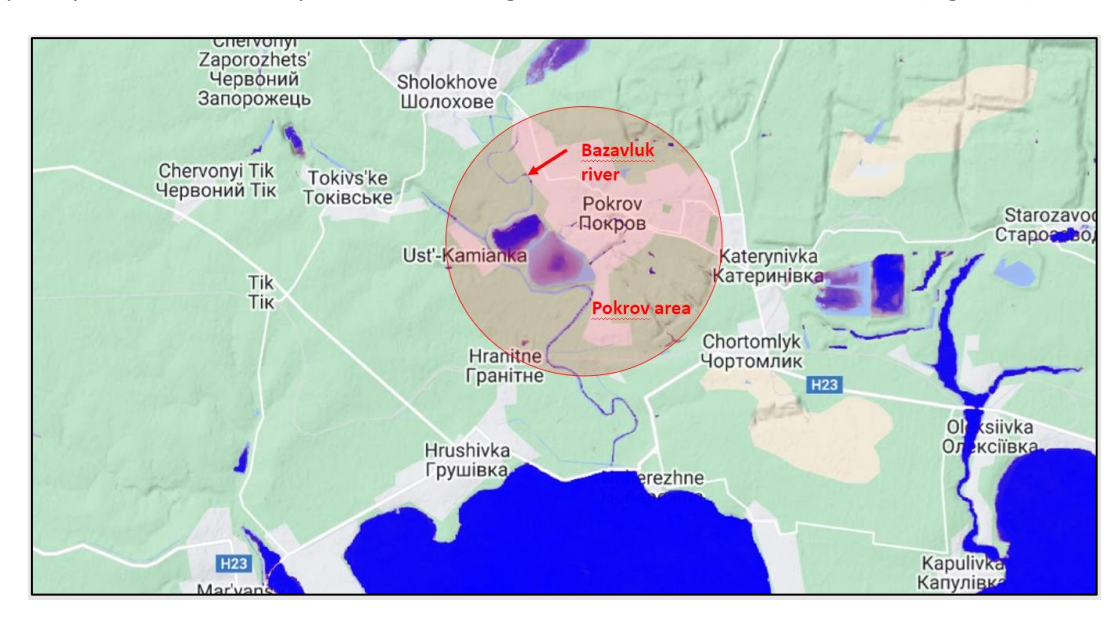
Figure 2 Pokrov and part of Bazavluk river (in dark blue are represented permanent bodies of water

valves and latches. The battery of filters of the water treatment plant will also be replaced with new frequency converters as they sustained damage due to the extended downtime (Figure 3).