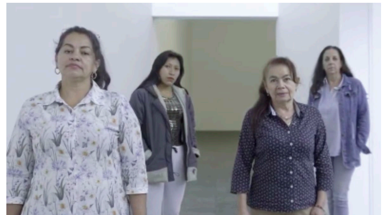
Survivors in Colombia, united in the network Red de Mujeres have played a key role in negotiating the country's peace agreement and are strong advocates for survivor-centred reparations.