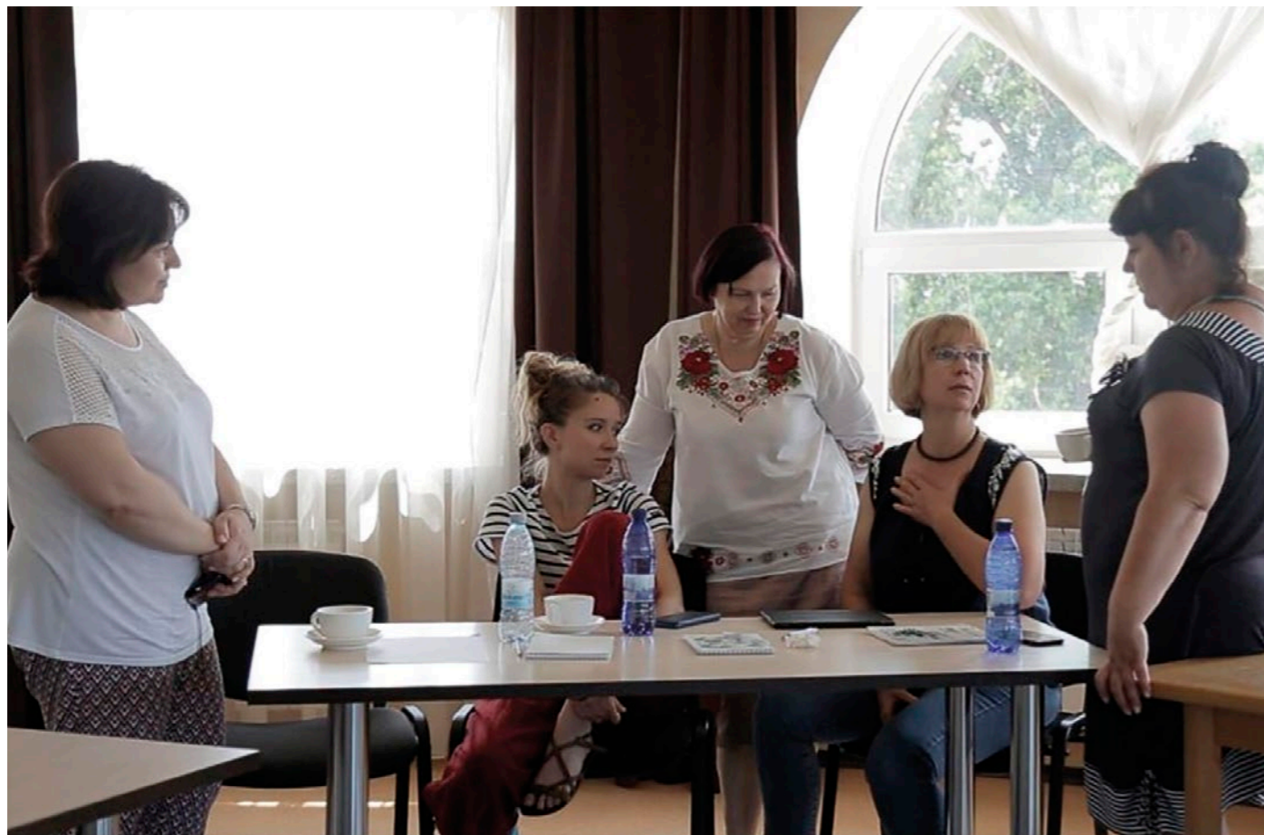
Meeting Ukrainian survivor network. Kyiv, August 2019.

Remaining committed to a collaborative and contextualised approach, the Global Survivors Fund has already established partnerships not only with local civil society organizations, but also international bodies, as well as the United Nations, including the Office of the SRSG-SCV and the Trust Fund for Victims of the International Criminal Court. The Global Survivors Fund also intends to expand its collaboration with academic institutions for the purpose of research and policy development, as well as the private sector for the purposes of fundraising and enhancing corporate responsibility.