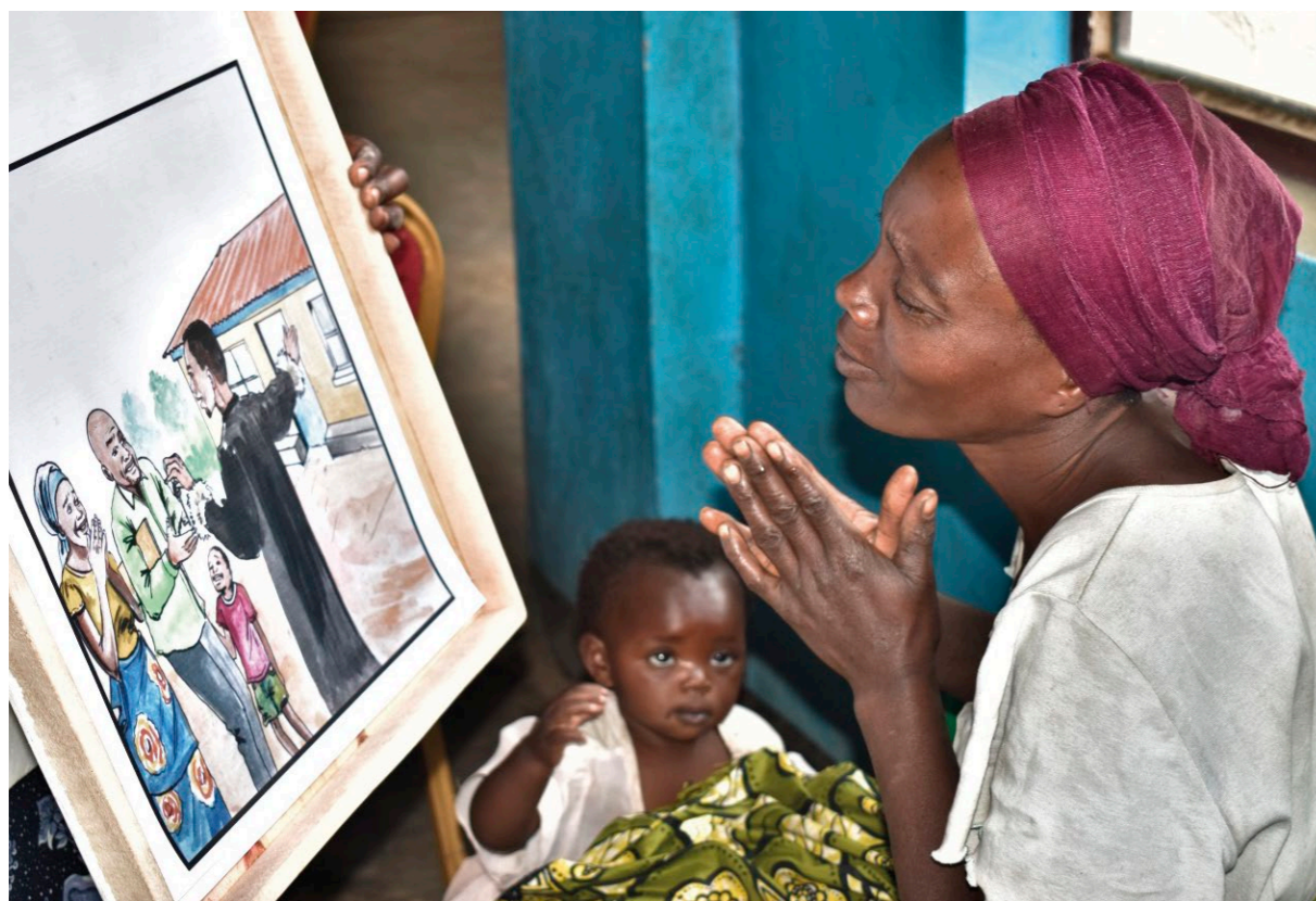
South Kivu, August 2020. Photo taken in a workshop with survivors about what reparation means to them.

The final report will be produced in 2021. The findings of the Global Reparations Study will in particular inform the Global Survivor Fund's selection of new projects.