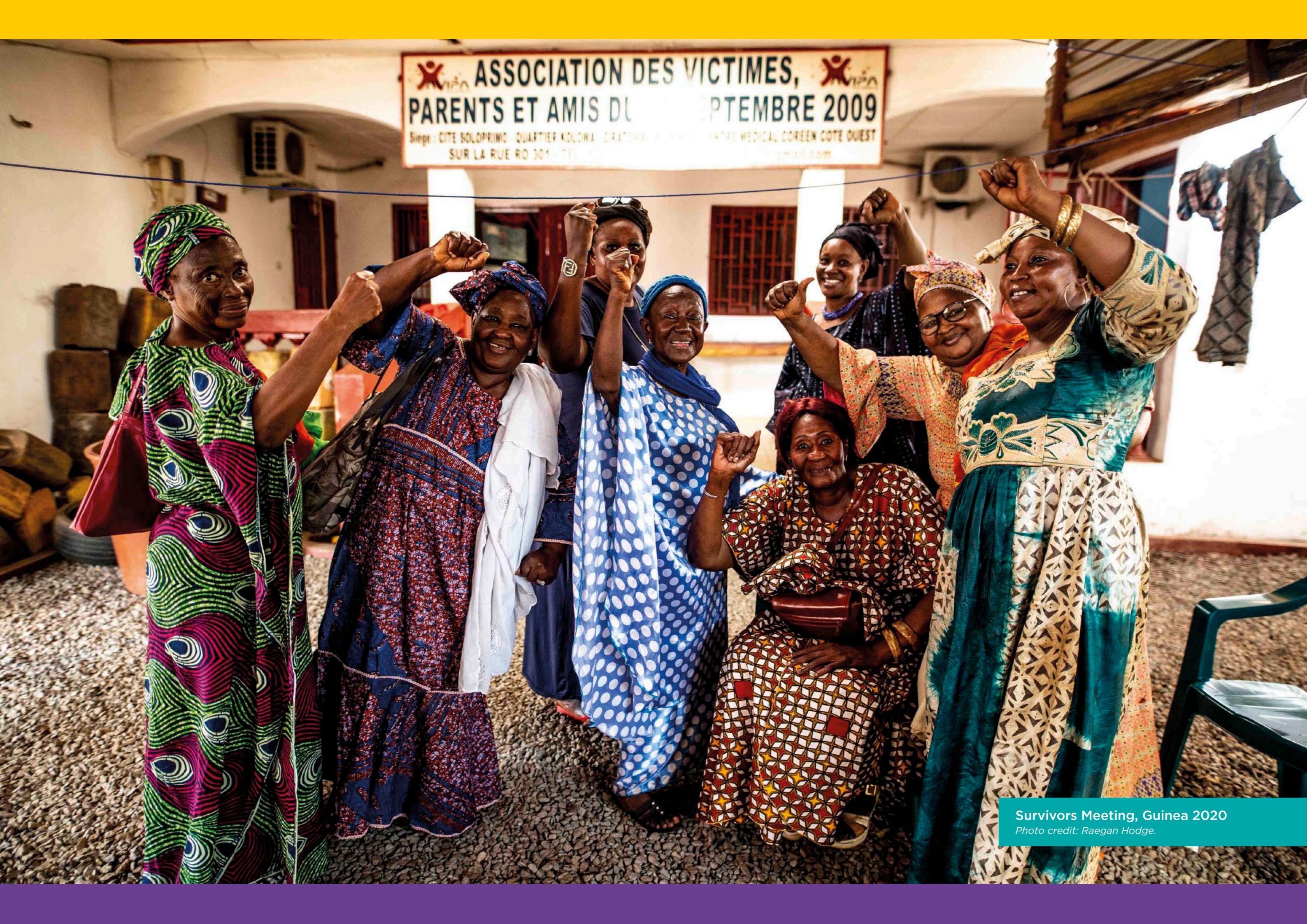
Survivors Meeting, Guinea 2020