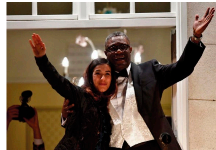
Nobel Peace Prize, Oslo, December 2018

In a historic moment on December 10, 2018, Dr. Mukwege and Nadia Murad received the Nobel Peace Prize for their efforts to end sexual violence as a weapon of war in armed conflict. From that moment on, Nadia Murad, as a survivor herself, being so aware of the importance of reparations and redress, joined Dr. Mukwege in this mission. Together they launched the Global Survivors Fund.